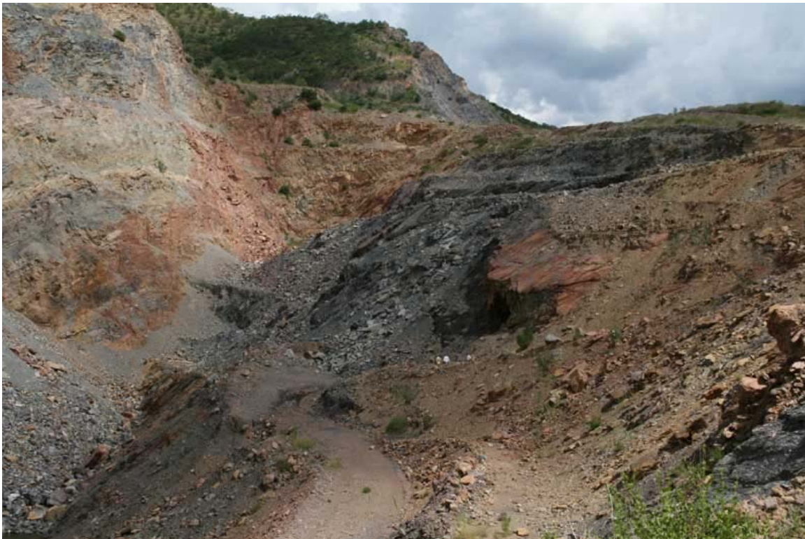
High grade pyretic black gold ore at the surface in the Amelia pit