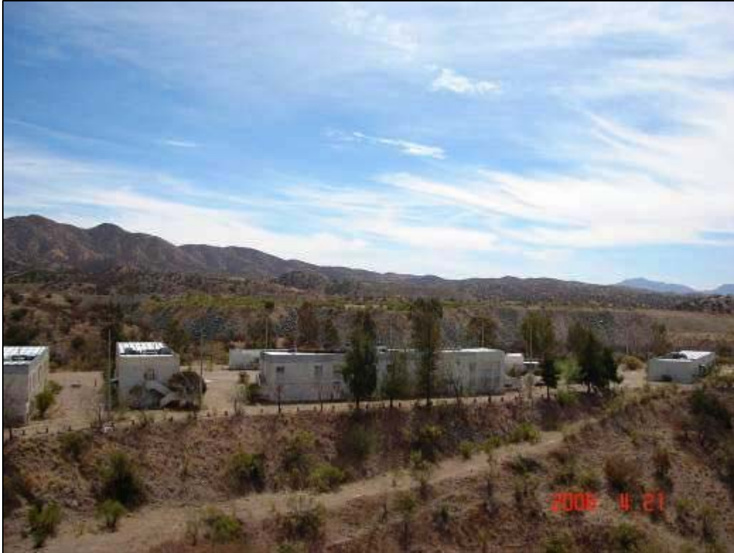
Santa Gertrudis Camp

They recently announced the Lixivien acquisition of the last known producing area of the district that they didn't already control.